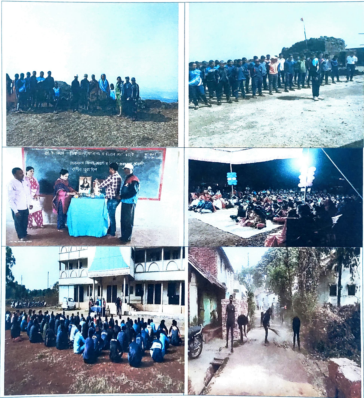
NSS Social Work at Madavale Village

NSS- our NSS department organizes activities like rallies cleaning campaigns workshops residential camps, awareness programmes throughout the year with help of other organizations. These activities have developed the personality of the students by making them socially sensitive and responsible.