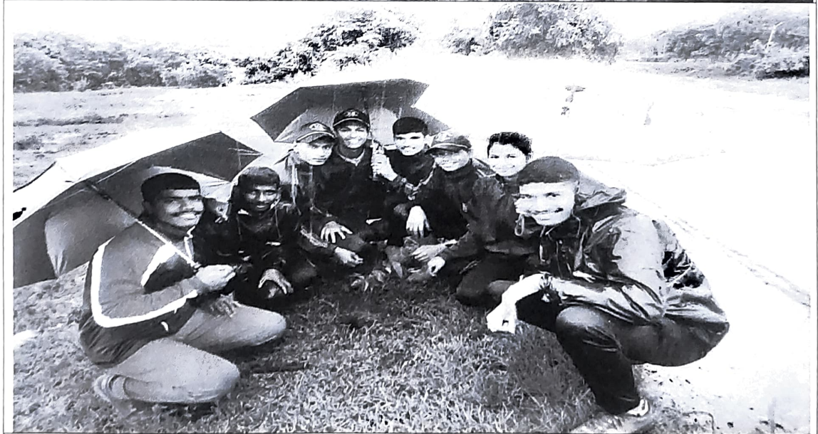
Tree Plantation Organized by NCC Unit